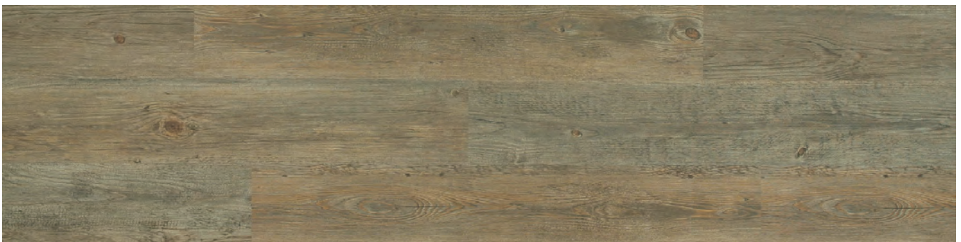
RWA 2639 T Goreme