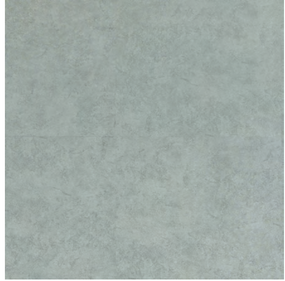
RT 3365 S Concreto