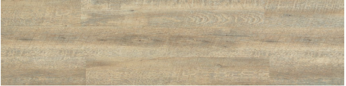
RWA 2627 T Rwenzori