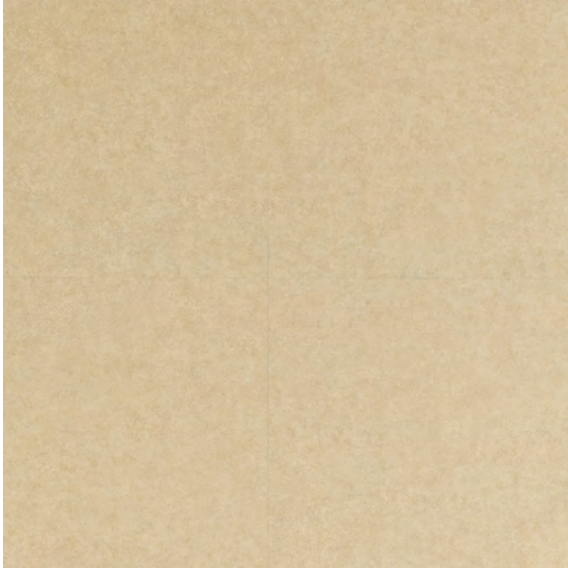
RT 3316 S Aggtelek