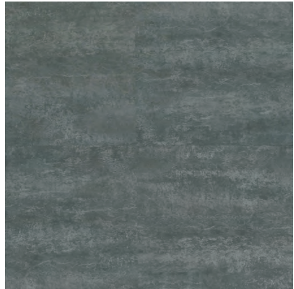
RT 3330 S Darien