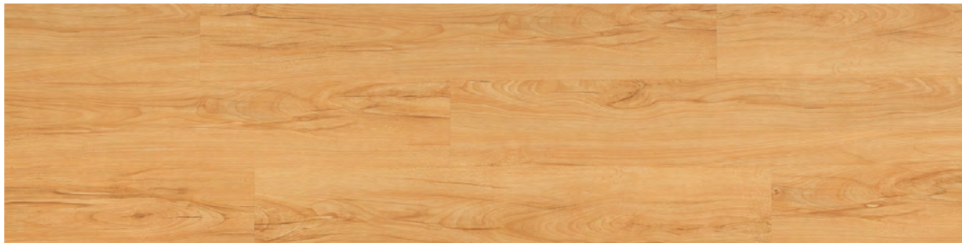
RWA 2645 Y Malpelo