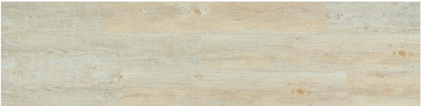
RWA 2633 T Hamiguitan