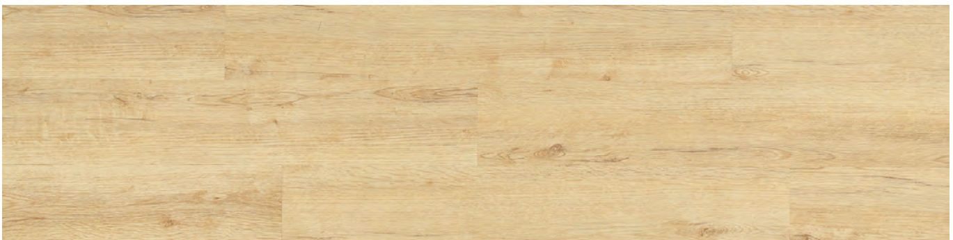
RWA 2615 T Cainaima