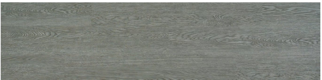
RWA 2681 Y Khaoyai