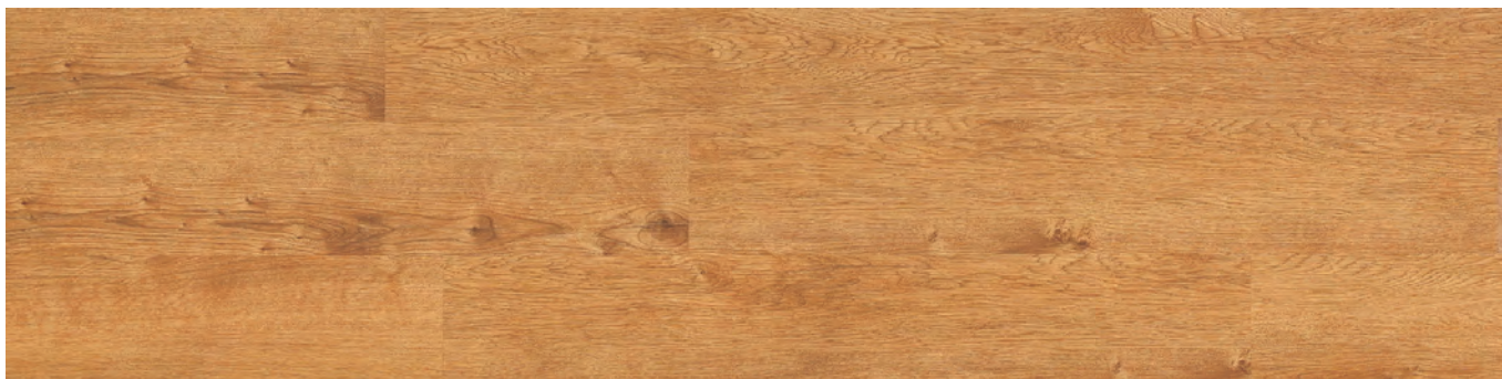
RWA 2619 T Willandra