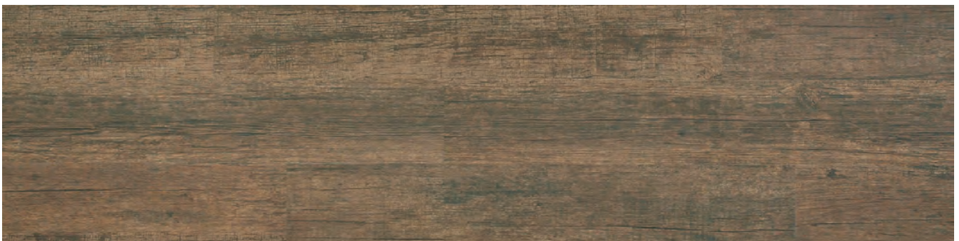
RWA 2655 T Pantanal