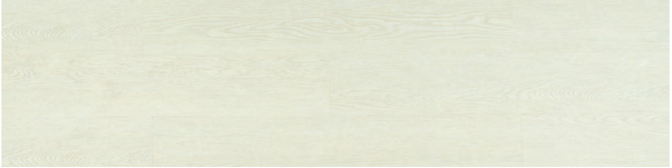
RWA 2612 T Altai