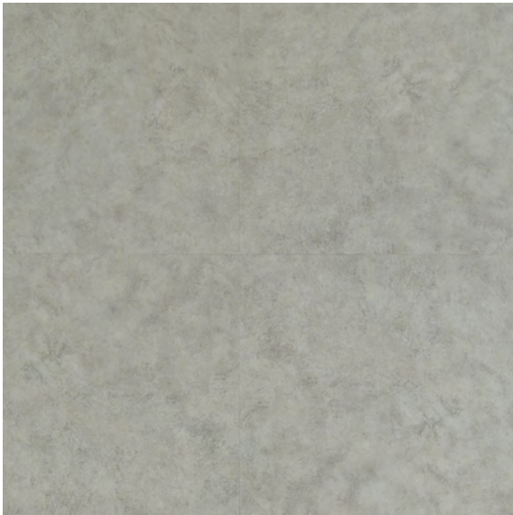
RT 3318 S Titano