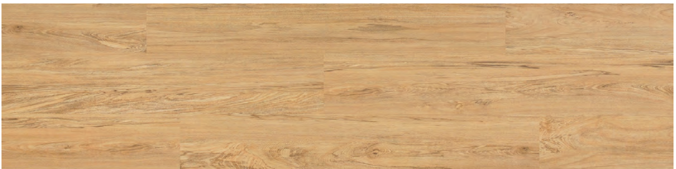
RWA 2669 Y Bwindi