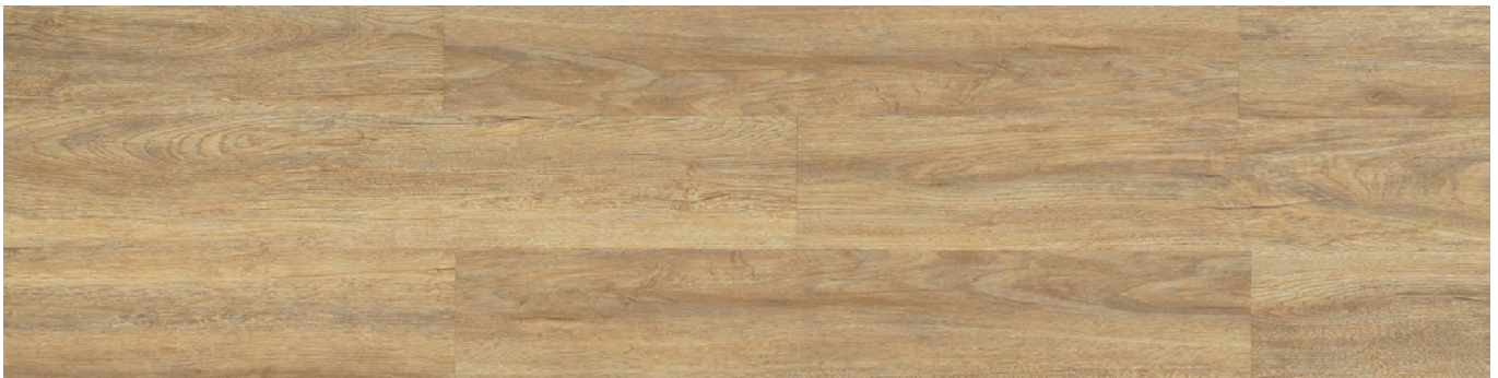
RWA 2637 T Teide