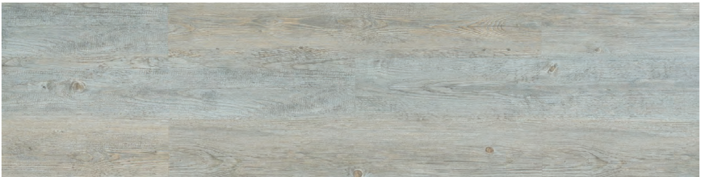
RWA 2626 T Sangay