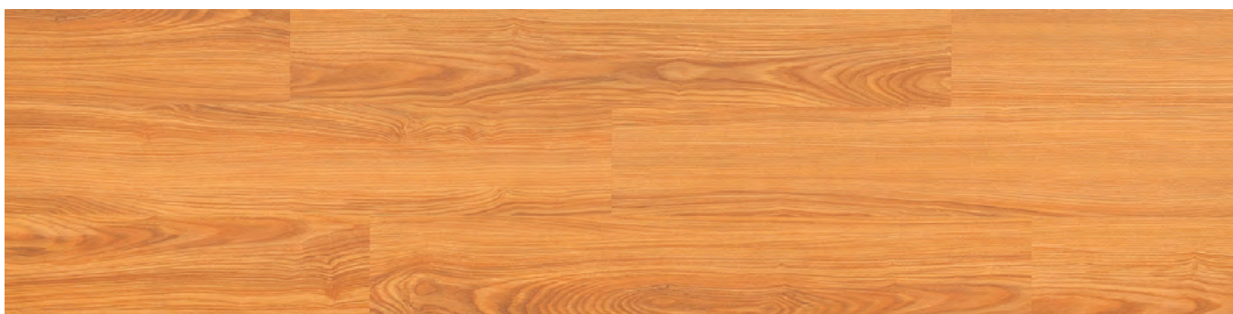
RWA 2640 Y Nahanni