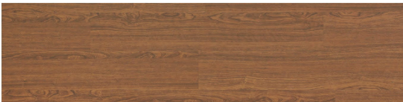
RWA 2652 Y Pyrenees