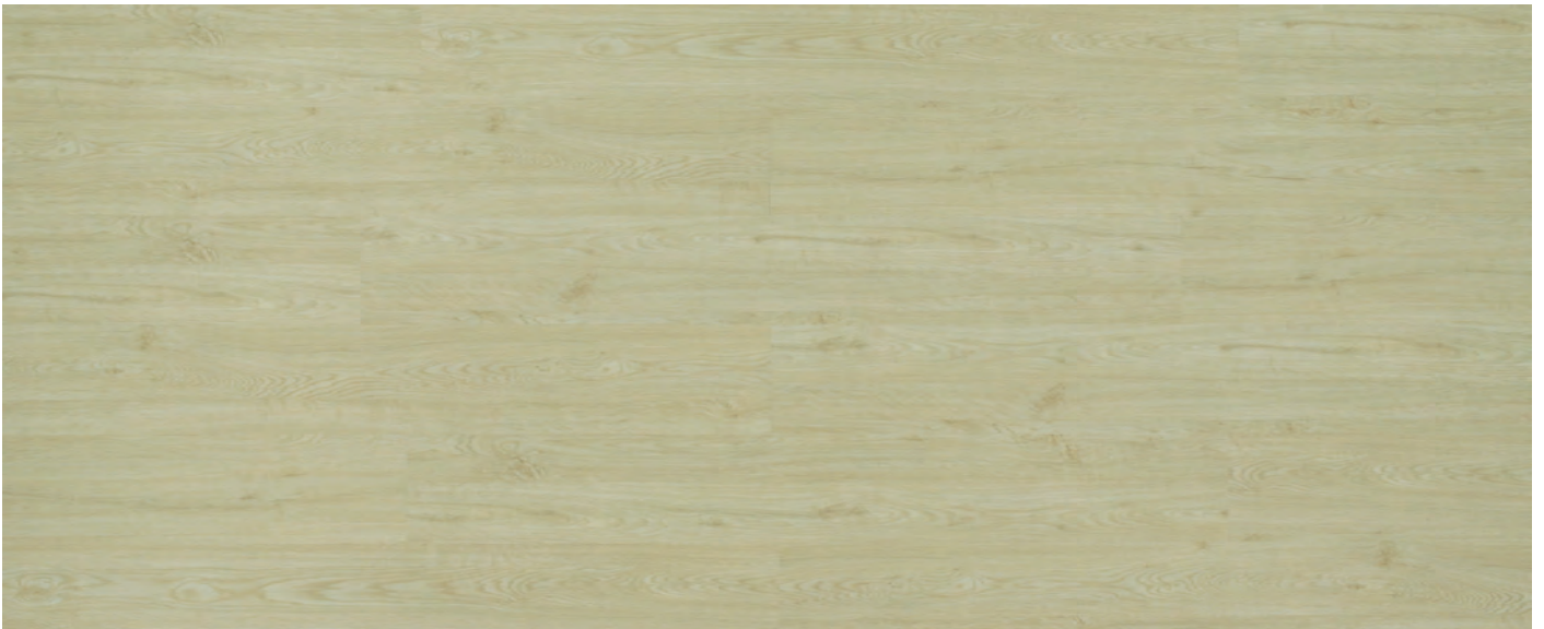
HT 6238 W Spanish Oak