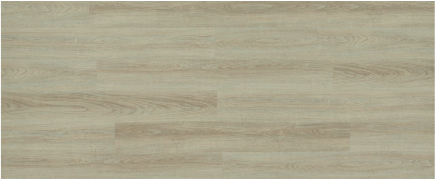
HT 6229 W Fraxinus