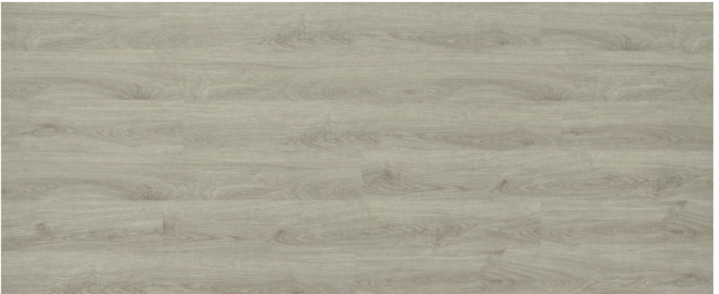
HT 6245 W American Ash