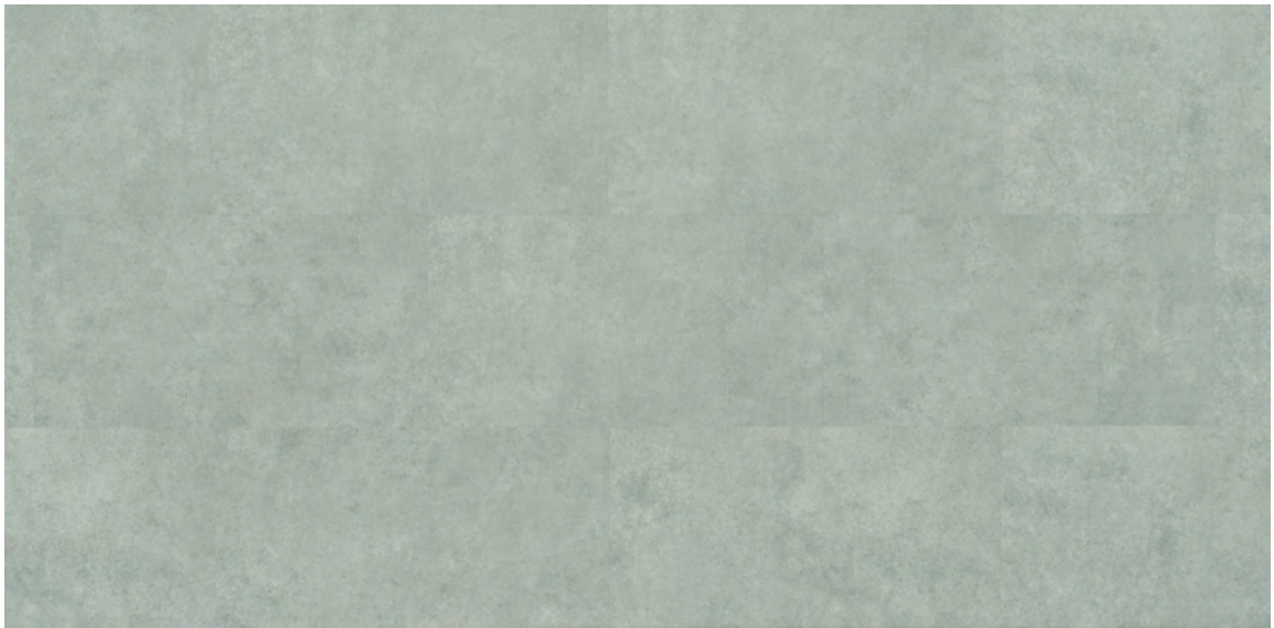
HT 6825 T Phyllite