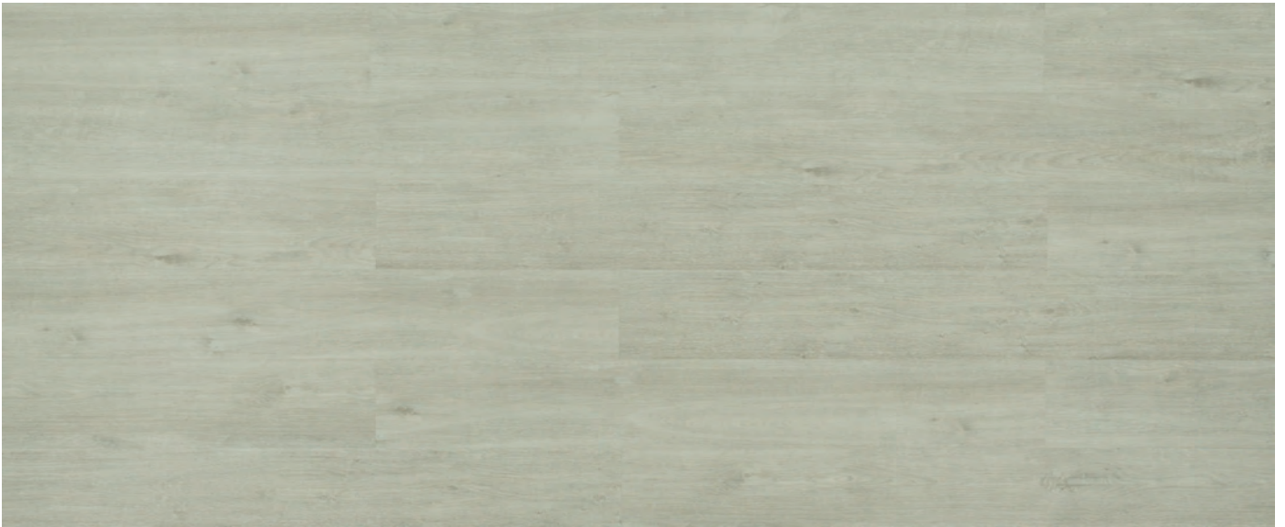
HT 6223 W European Oak