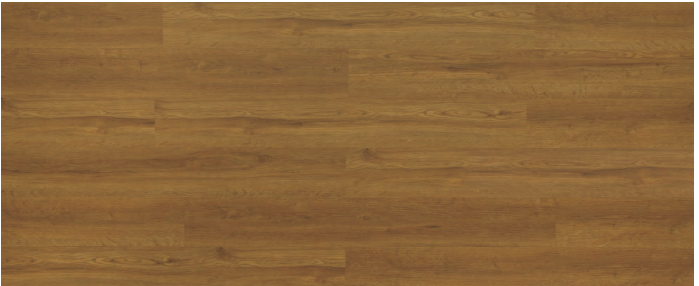
HT 6255 W Cherrybark Oak