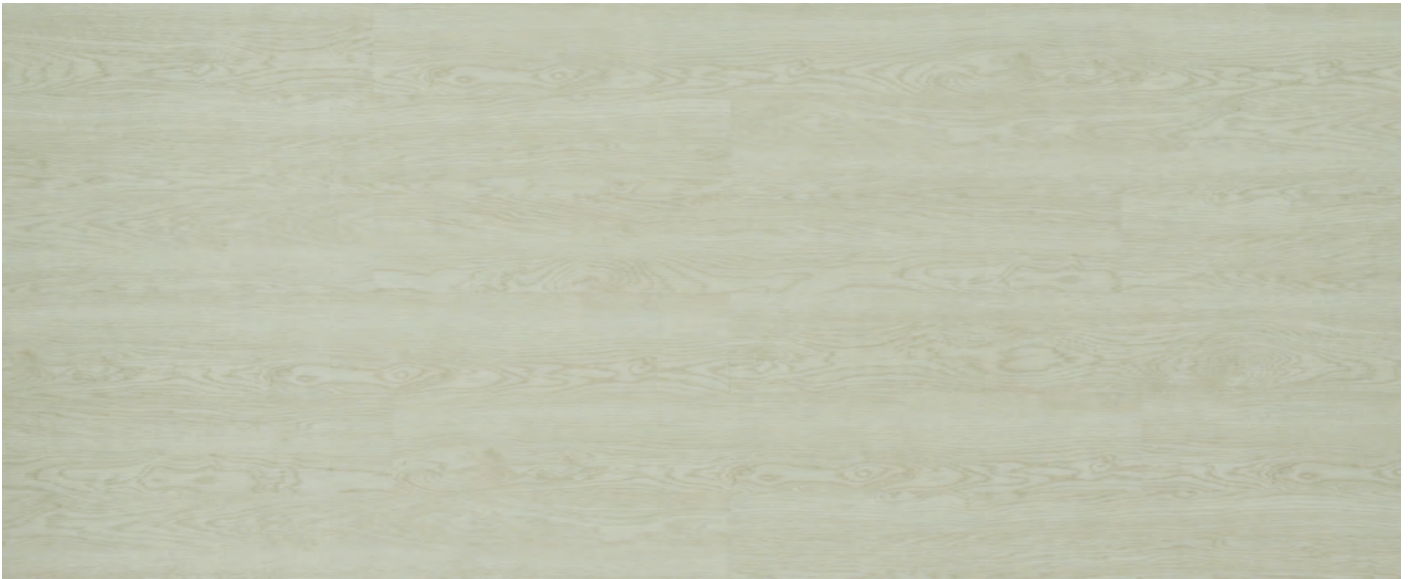
HT 6211 W Canadian Ash