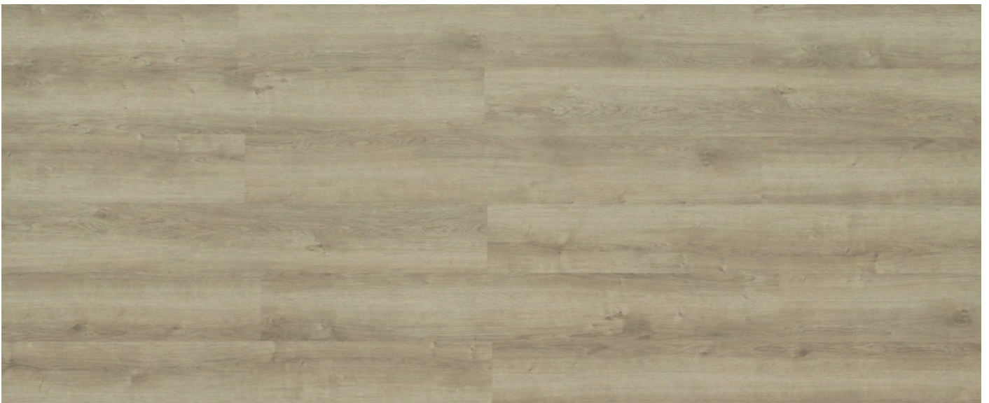
HT 6256 W Japanese Oak