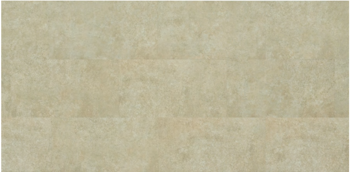
HT 6813 T Caliche