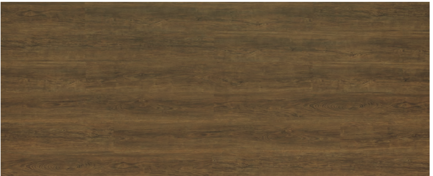
HT 6268 W Peruvian Walnut