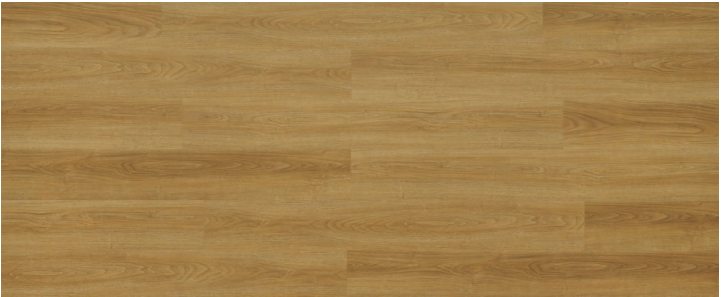
HT 6230 W French Rovere