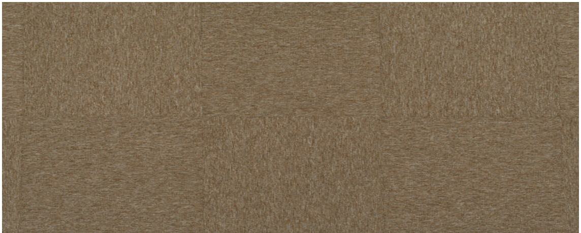
E 633 RHODONITE BEIGE