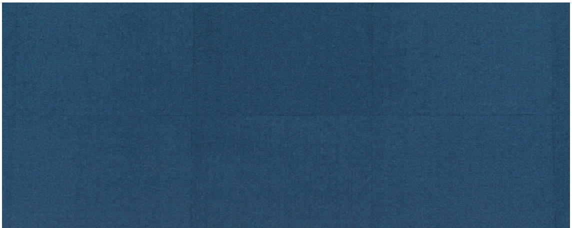
E 658 AZURITE BLUE