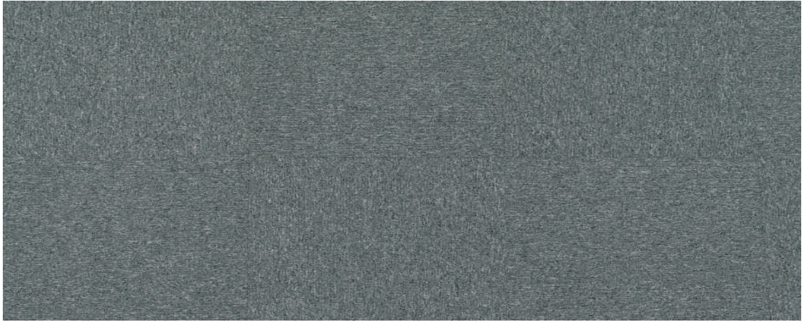
E 611 TITANIUM GREY