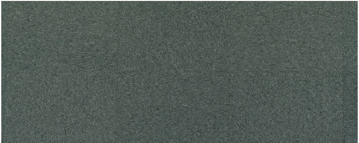
E 618 LABRODOLITE GREY