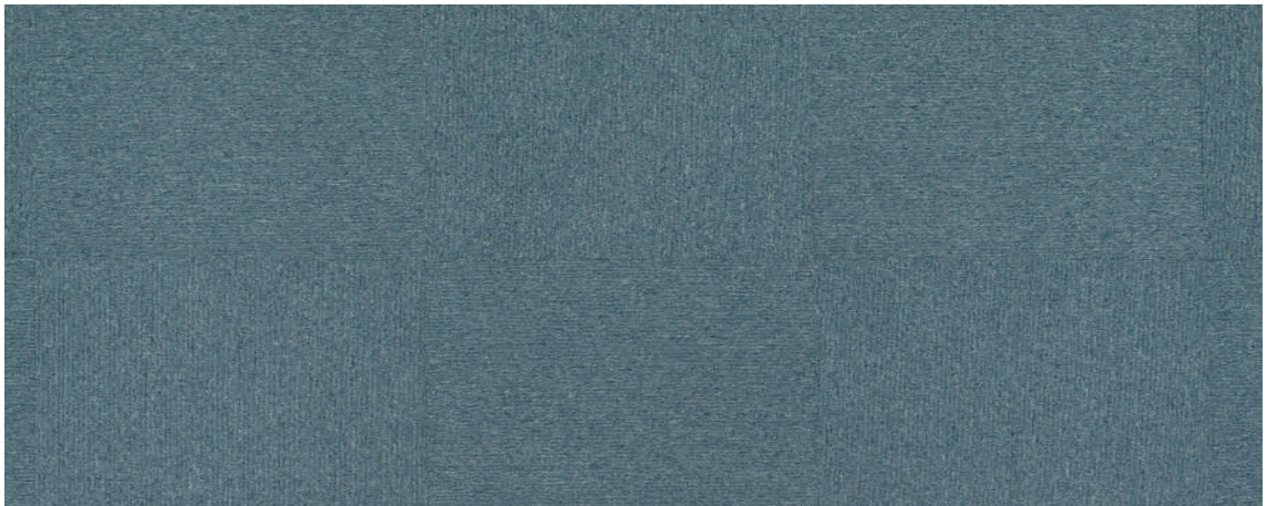
E 657 SPECTROLITE BLUE