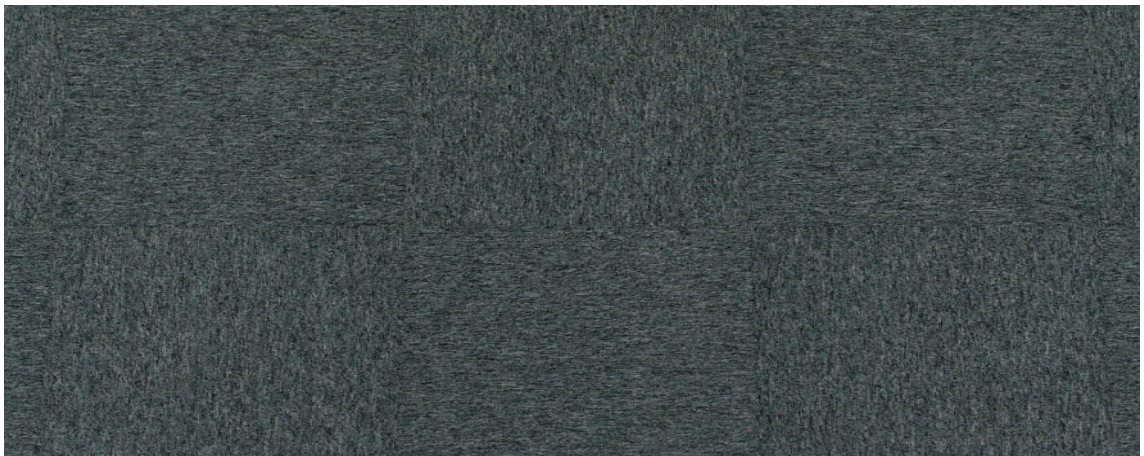
E 619 HEMATITE