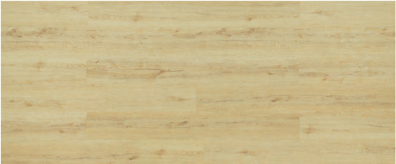
SJ 1525 W Mortimer Oak