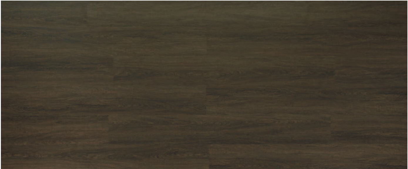
SJ 1567 W Backmuir Walnut