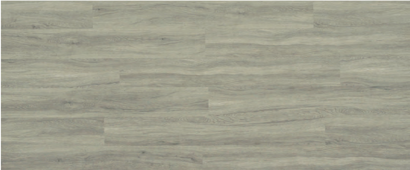
SJ 1518 W Kielder Oak