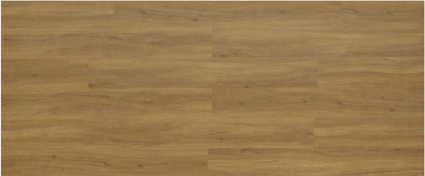
SJ 1683 W Amrak Oak