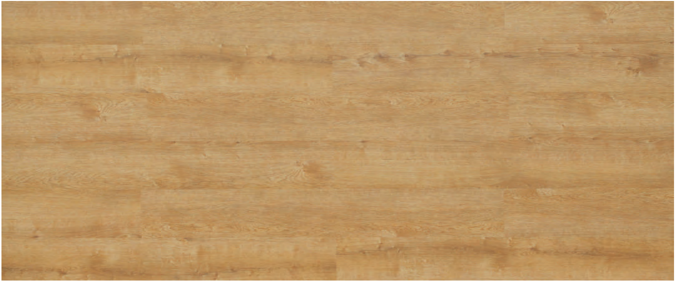
SJ 1536 W Horsford Oak