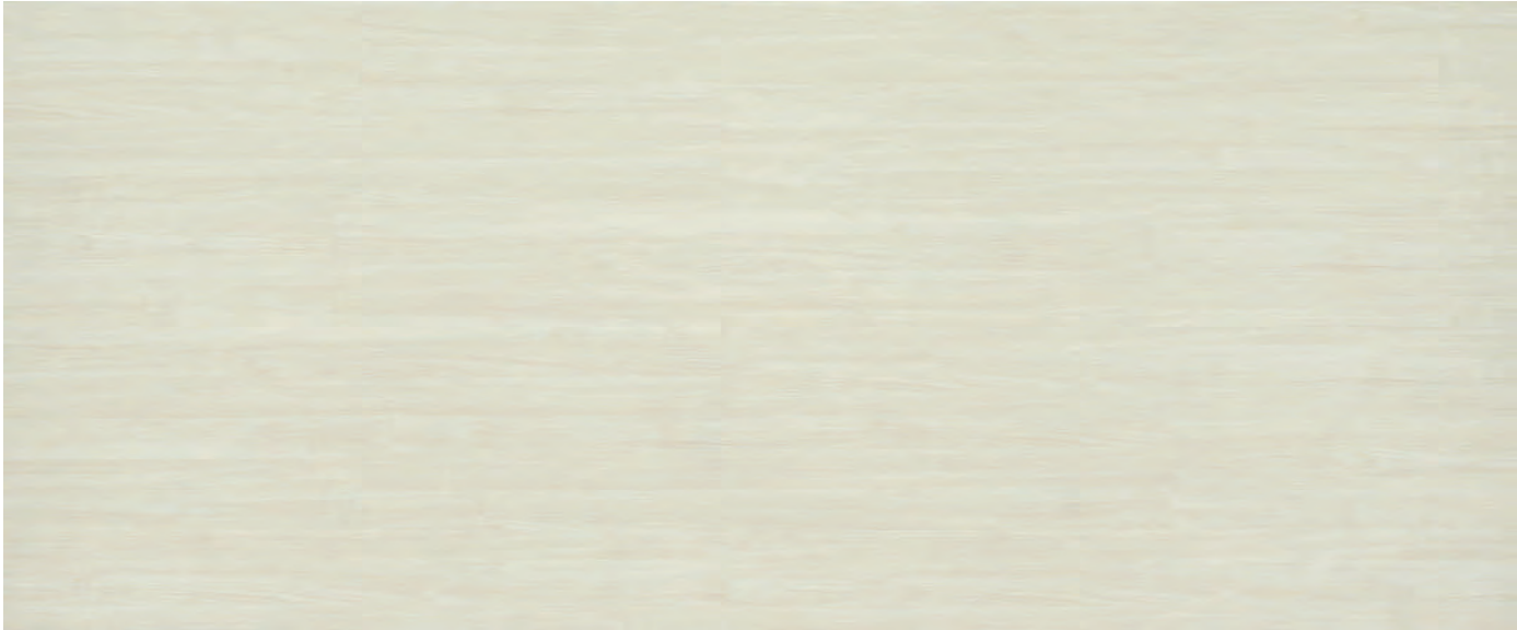
SJ 1608 W Milford Oak