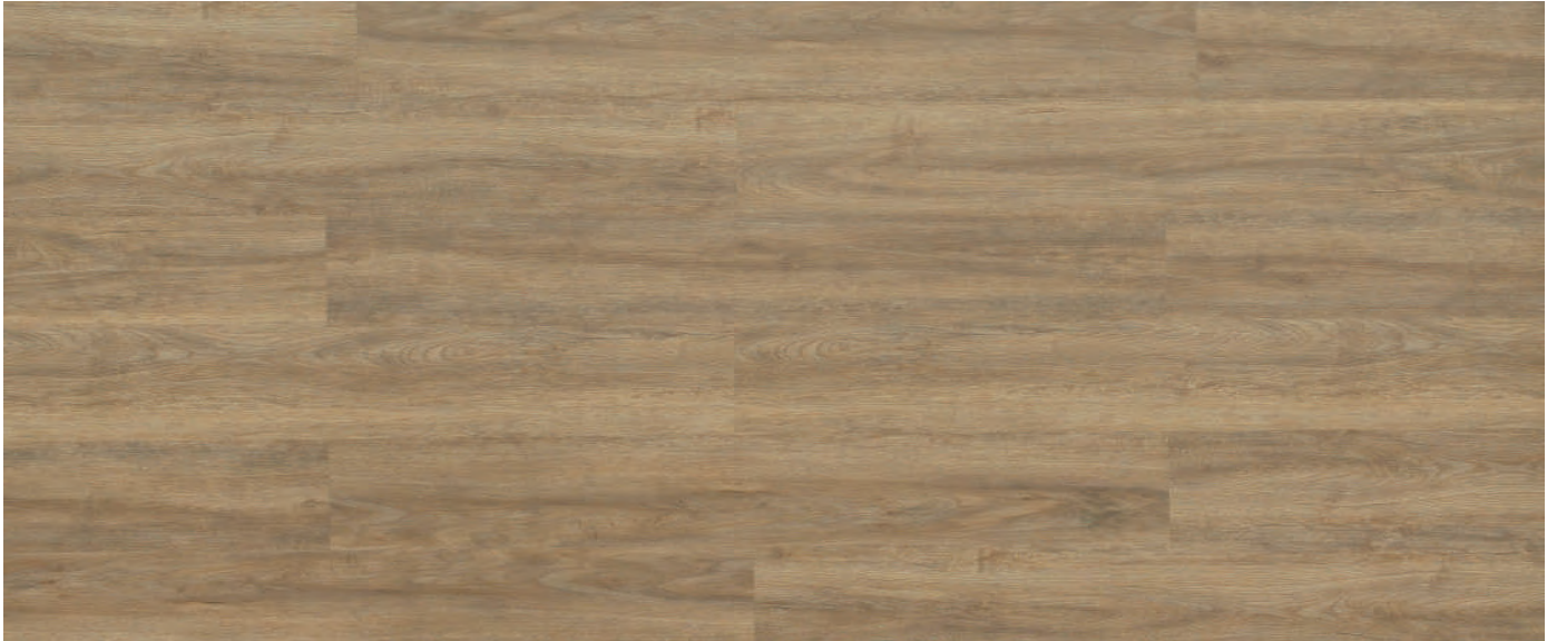
SJ 1521 W Charnwood