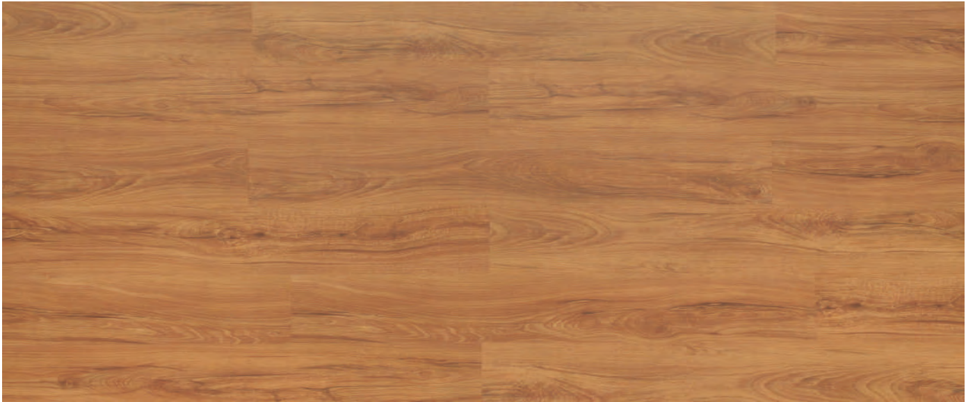
SJ 1540 W Ettrick Beech