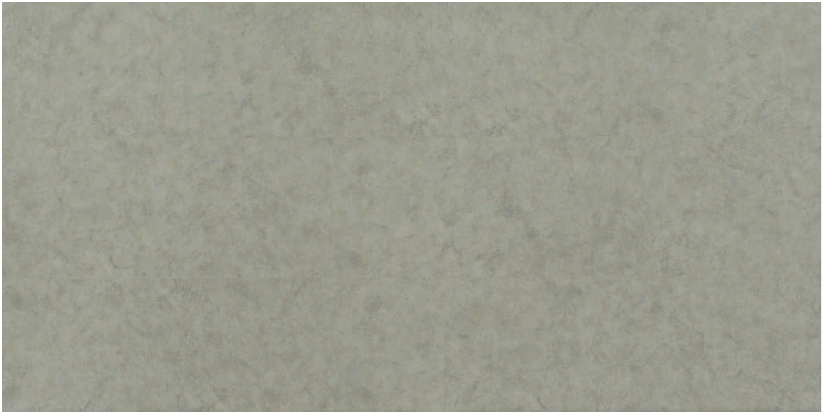
SJ 1503 TM Norfolk Stone