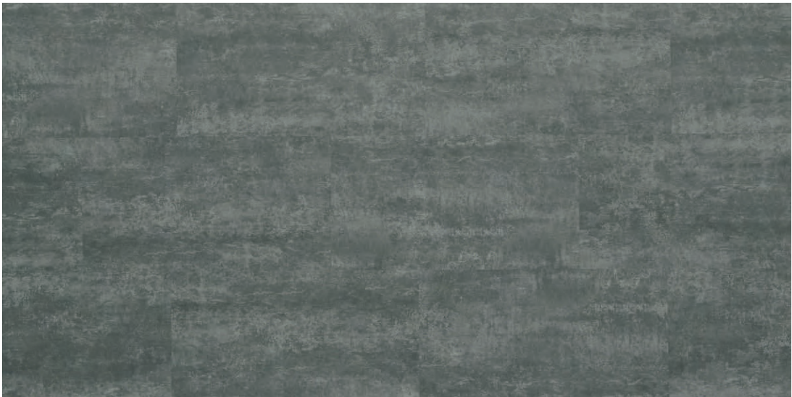
SJ 1505 T Saintorini Stone