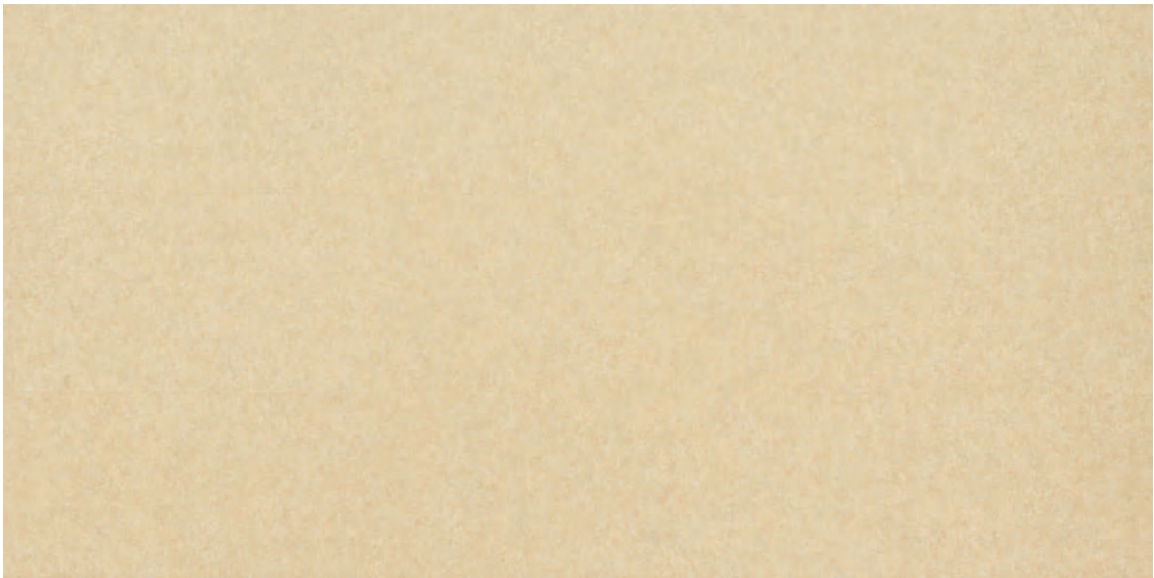
SJ 1508 T Cheshire Stone

Tile : 12" x 24" x 4 mm Size : 305 x 610 x 4 mm