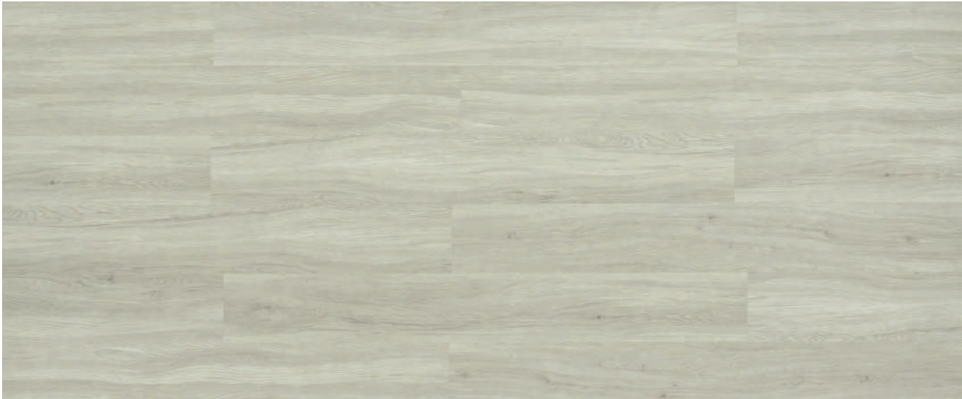
SJ 1512 W Friston Oak