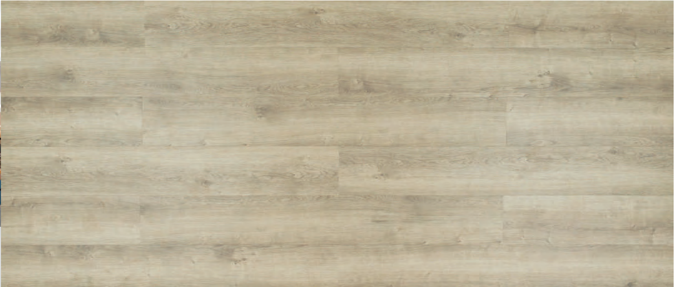
SW 55126 Windsor