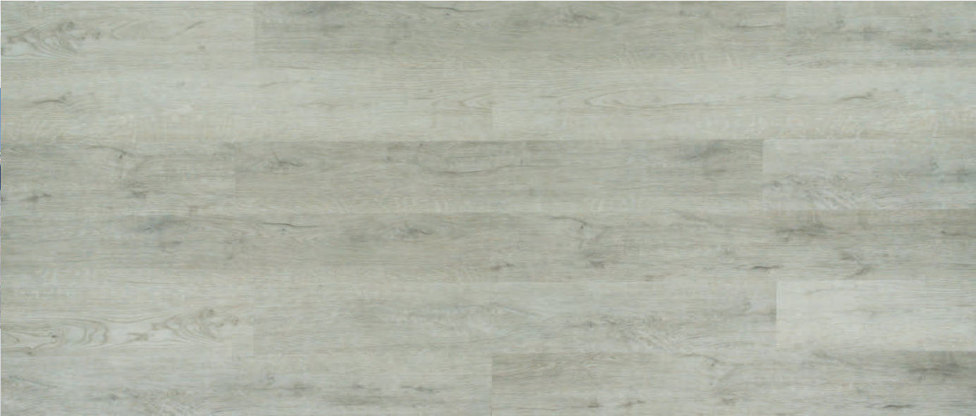
SW 55137 Jurassic