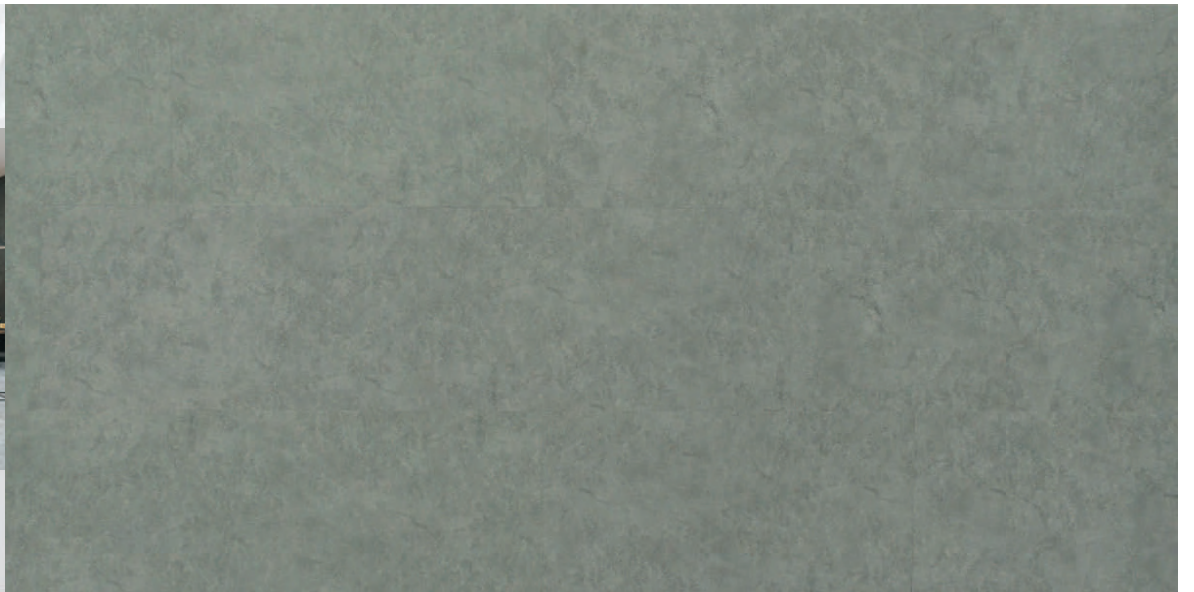
SK 3636 T Beton