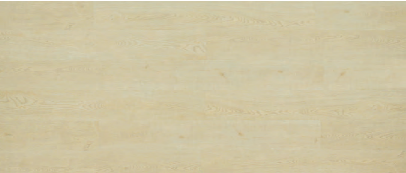
SW 55123 Giza