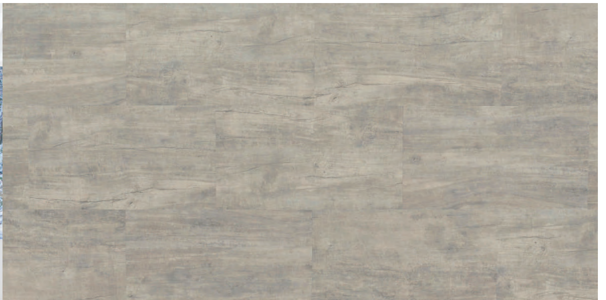
SK 3622 T Ruskeala