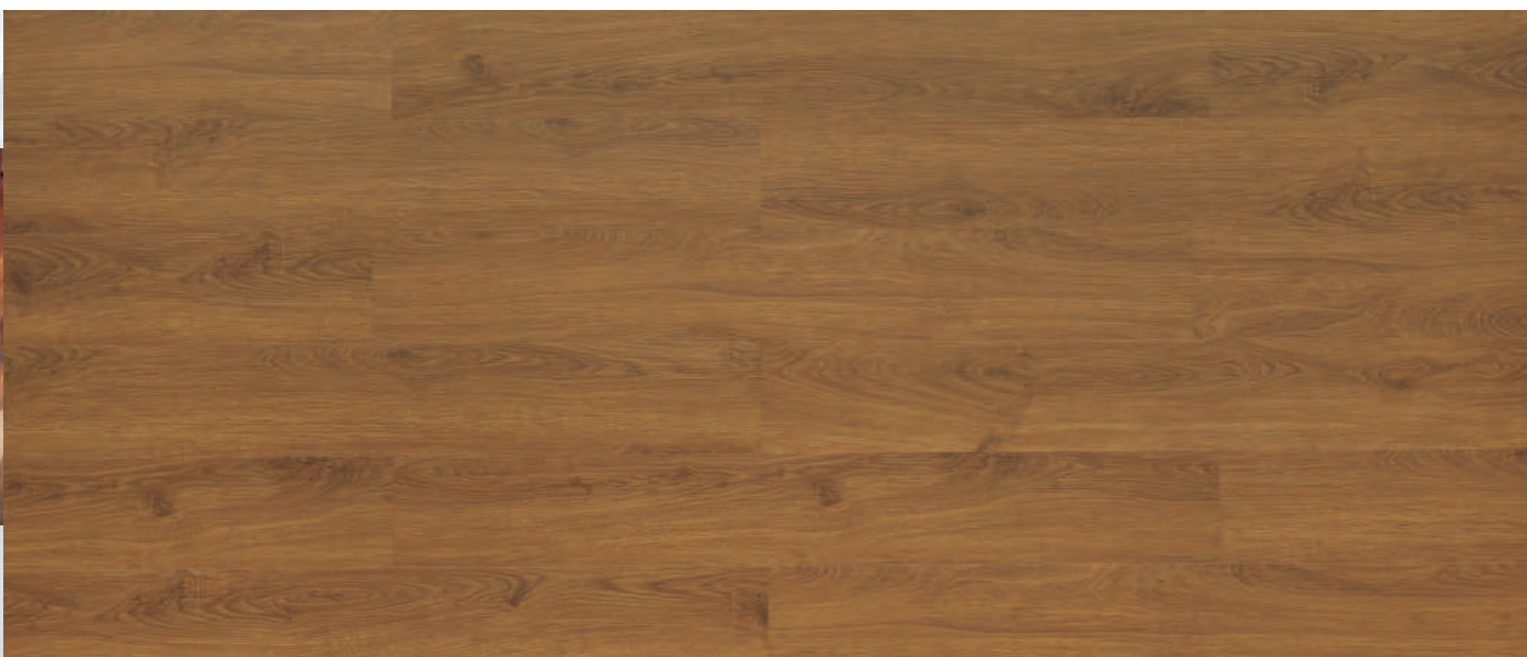
SW 55265 Krafla