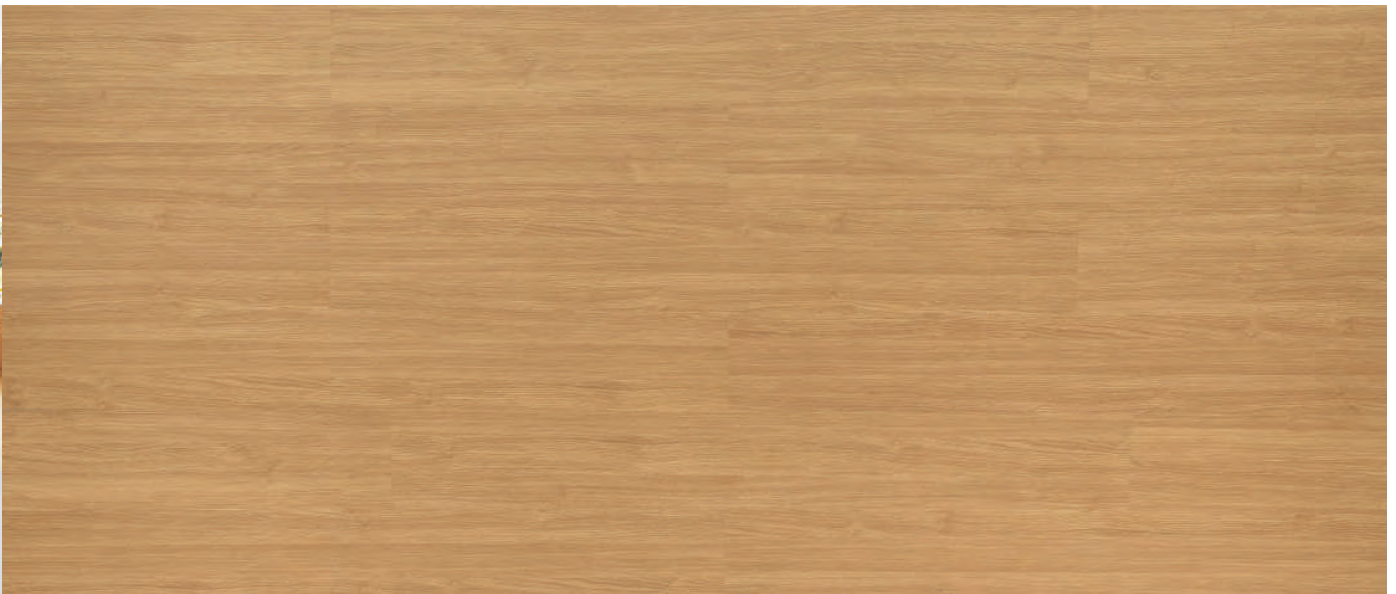
SW 55158 Castle