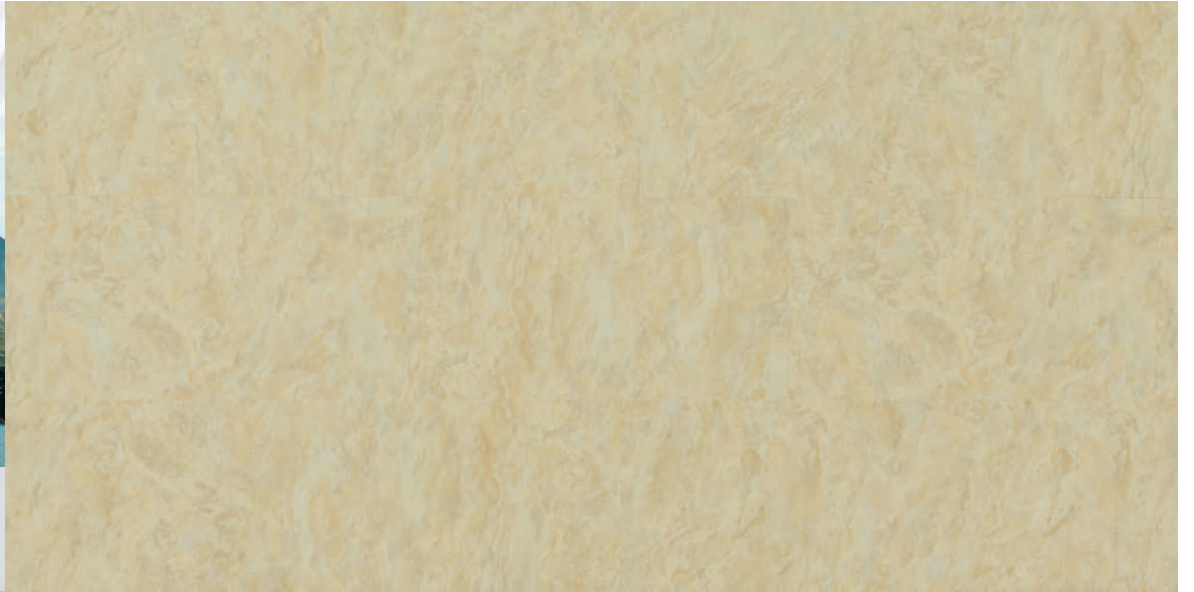
SK 3618 T Marmo