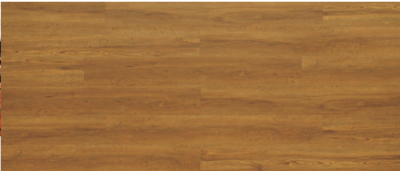
SW 55251 Castillo