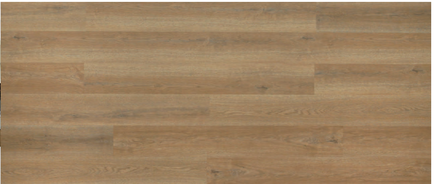
SW 55331 Juglans