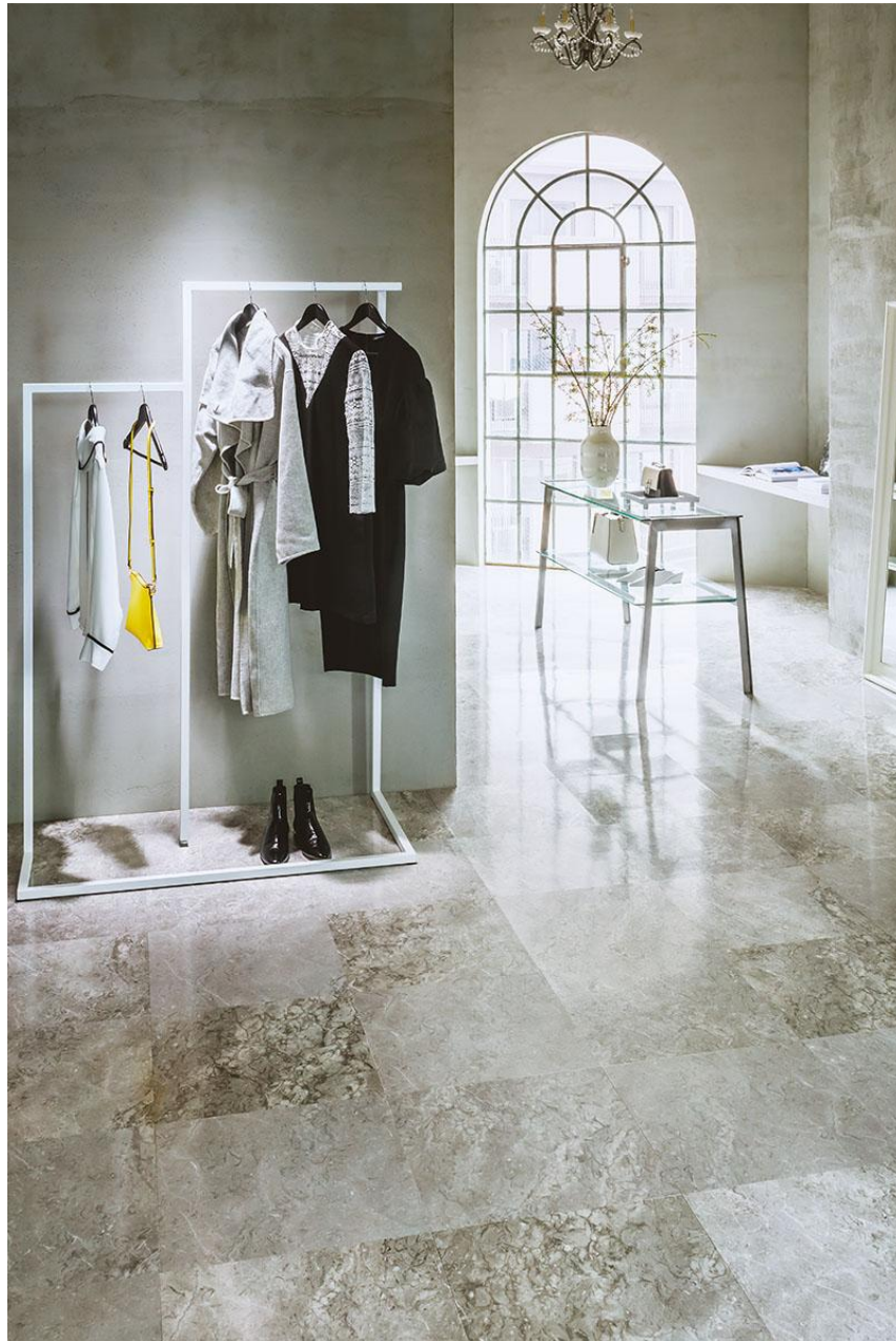
MATIL MBE-501,502(Henry IV)

Flooring material: Matil Pattern name : Henry IV