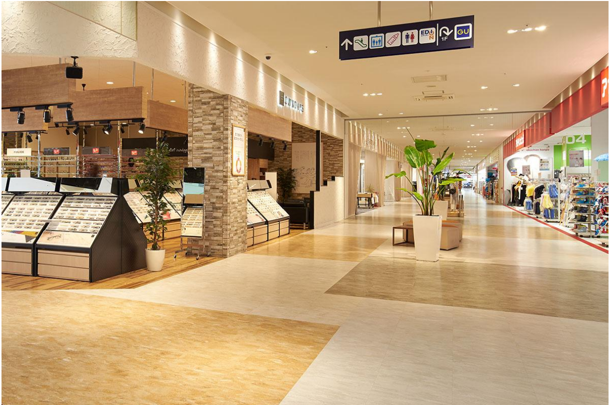
MONOSTEIN TH-1103( Luxury Beige) ,1106( Gold Slate) ,1113(Ramon Gray)

Flooring : MONOSTEIN Pattern name : Luxury Beige, Gold Slate , Ramon Gray