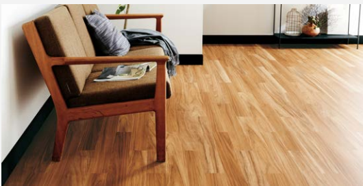
Vinyl Tile WOODLINE

This collection presents a grand total of 148 colors, with a diverse array of wood grain patterns spanning different levels of brightness and saturation. The intricate depiction of the wood grain is realistically expressed, and the surface coating enhances both stain resistance and durability. As an illustrative instance from the numerous color patterns available, we provide an image of some shops with wood grain patterns exhibiting varying degrees of brightness.