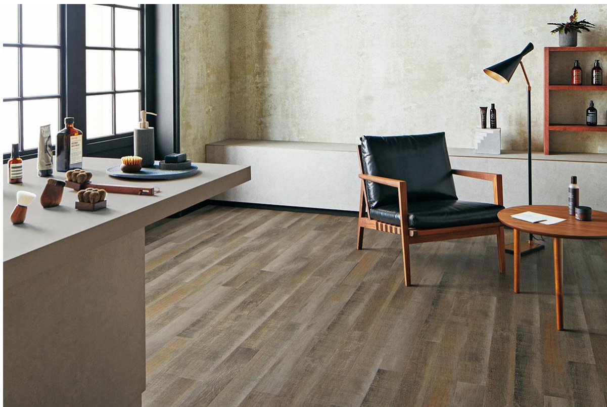
WOODLINE WBA-601 (Celvoke)

Floor Material : WOODLINE Pattern name : Celvoke