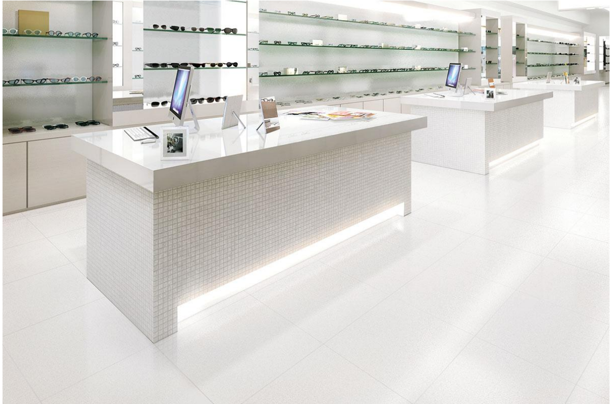
MACKIREINE MQE-101 (Ceramic)

Flooring material: MACKIREINE Pattern name : Ceramic