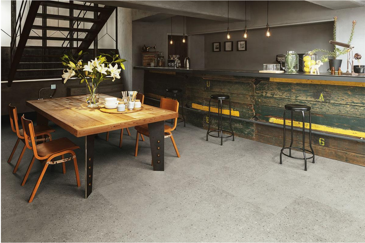
MATIL MBE-515(Embedded Concrete)

Flooring material: MATIL Pattern name : Embedded Concrete