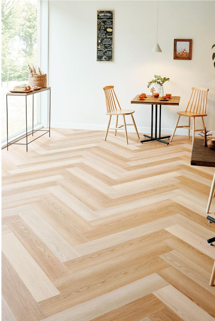
WOODLINE WBH-418,419,420 (European Oak)

Floor material : WOODLINE Pattern name : European Oak