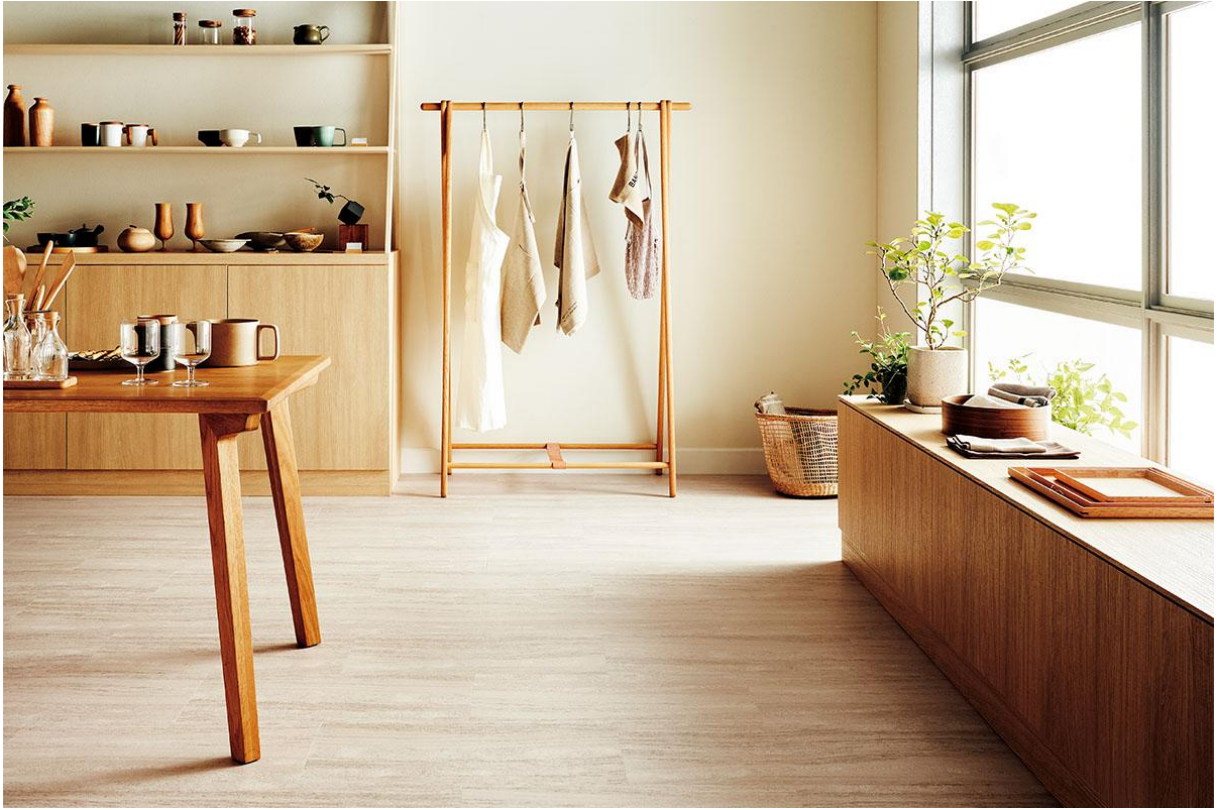
MATIL MBM-573(Sand Sandstone)

Flooring material: Matil Pattern name : Sand sandstone