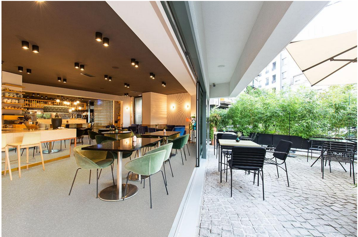
INLAID MIX style MS IM-2302 (Warm Gray)

Floor material : NLAID MIX style MS Pattern name : Warm Gray