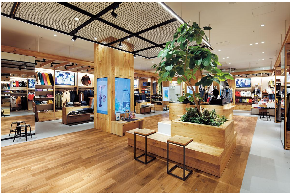
WOODLINE WBH-603 (Various Oak)

Flooring material : WOODLINE Pattern name : Various oak