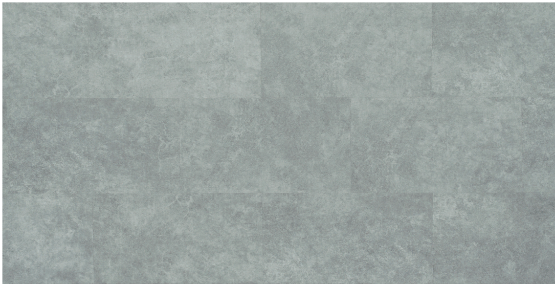
SM 3003 A Copenhagen *