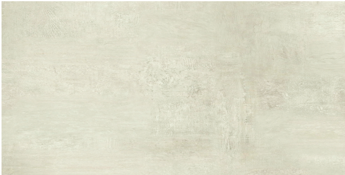
SM 2002 A Boston *

* Tile 12" x 24" x 6 mm Size: 305 x 610 x 6 mm