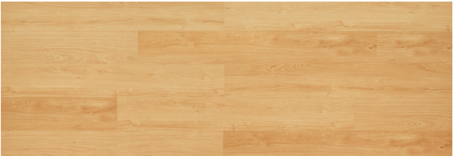
SM 958 U Adelaide