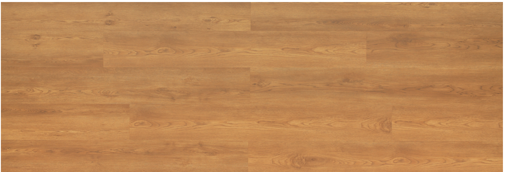
SM 972 U Vienna

Note: Product woodgrain and tonality may differ from samples