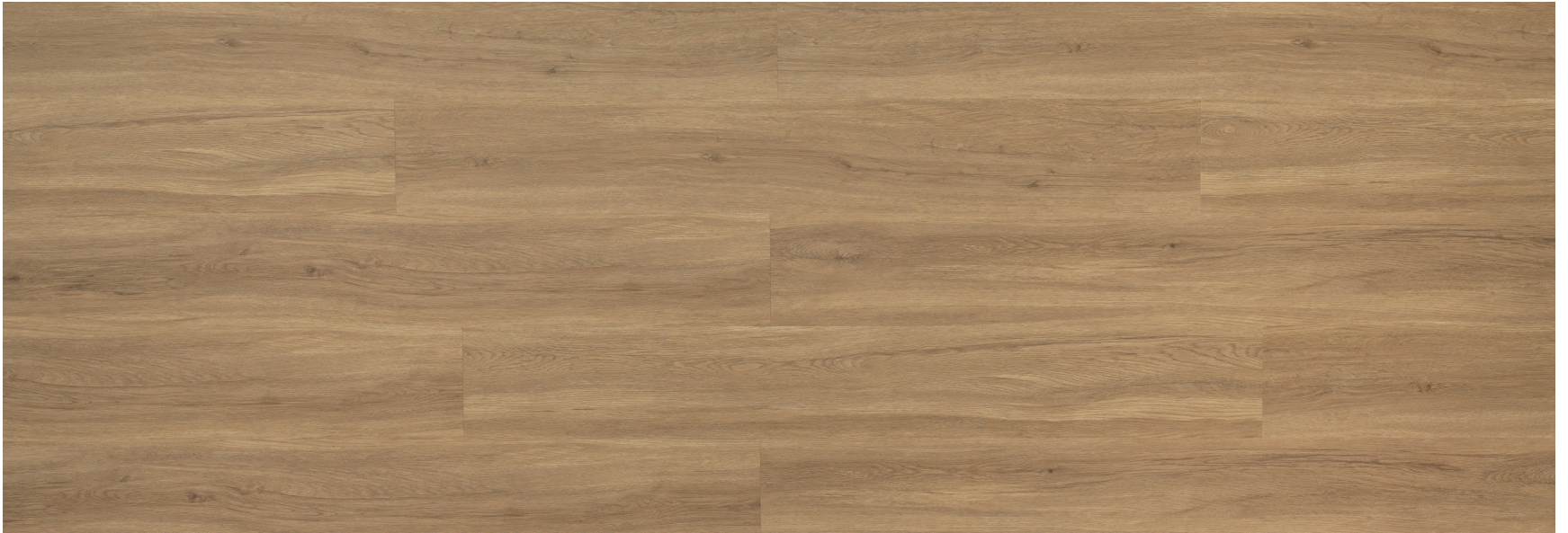
SM 933 U Toronto