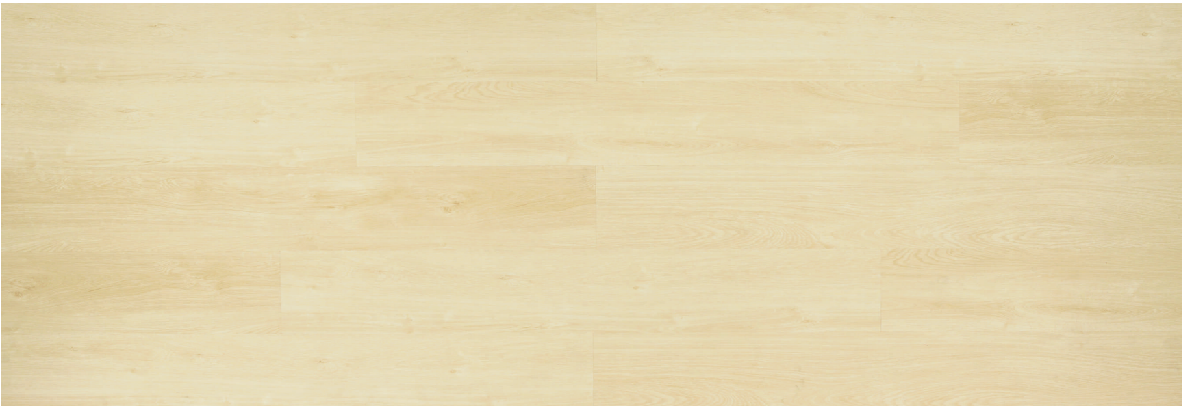
SM 911 U Osaka