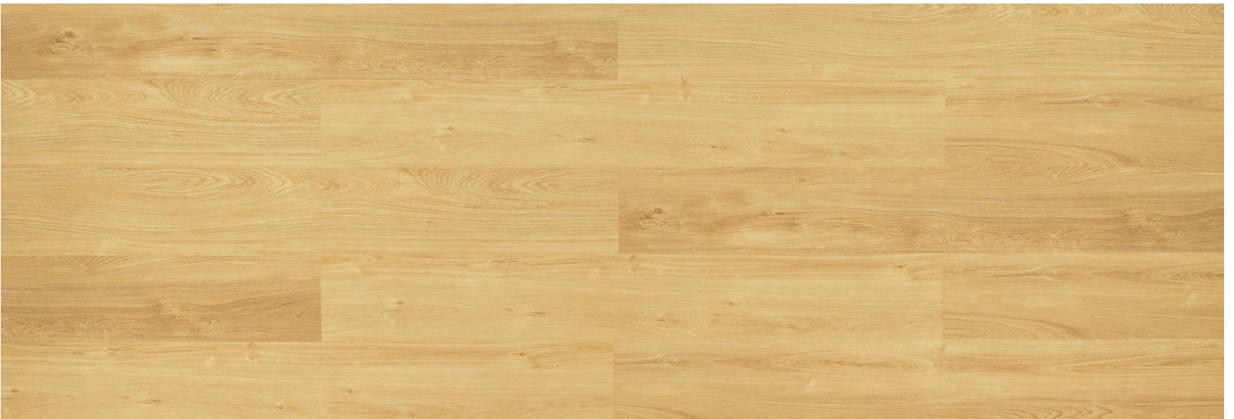
SM 925 U Calgary

Note: Product woodgrain and tonality may differ from samples