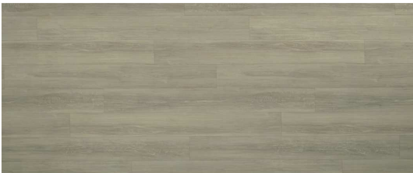
1149 Light Grey-Albion