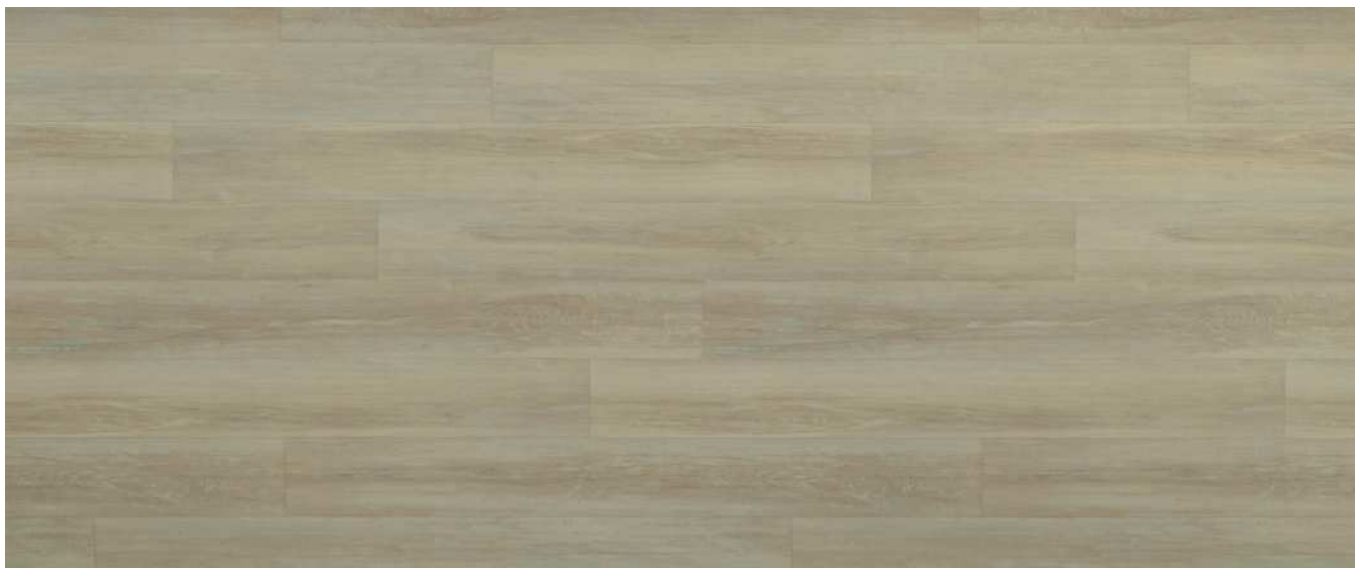
1147 Light Beige-Albion

Size : 2 x 20 m x 2.0 mm Wearlayer : 0.55 mm