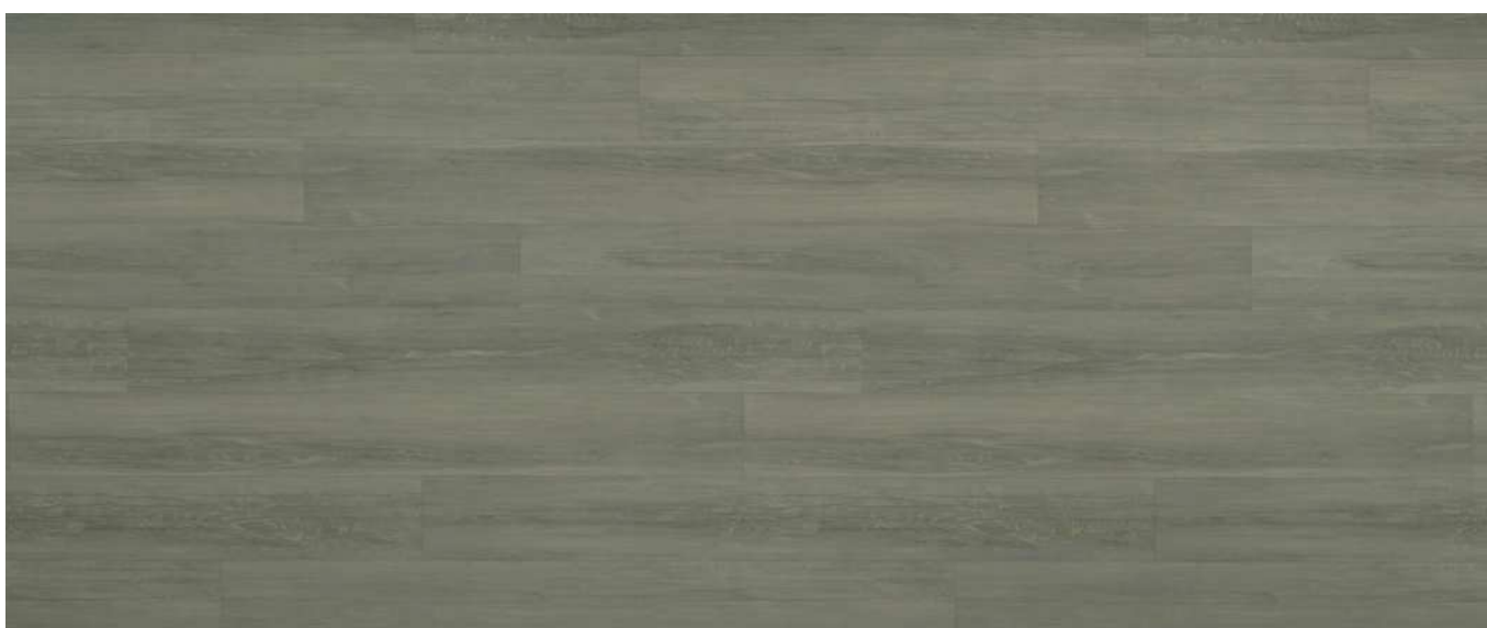
1151 Deep Grey-Albion