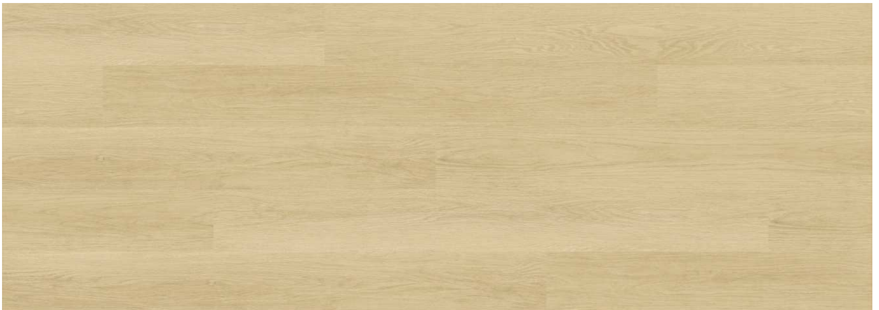
CMD 5113 W Capri