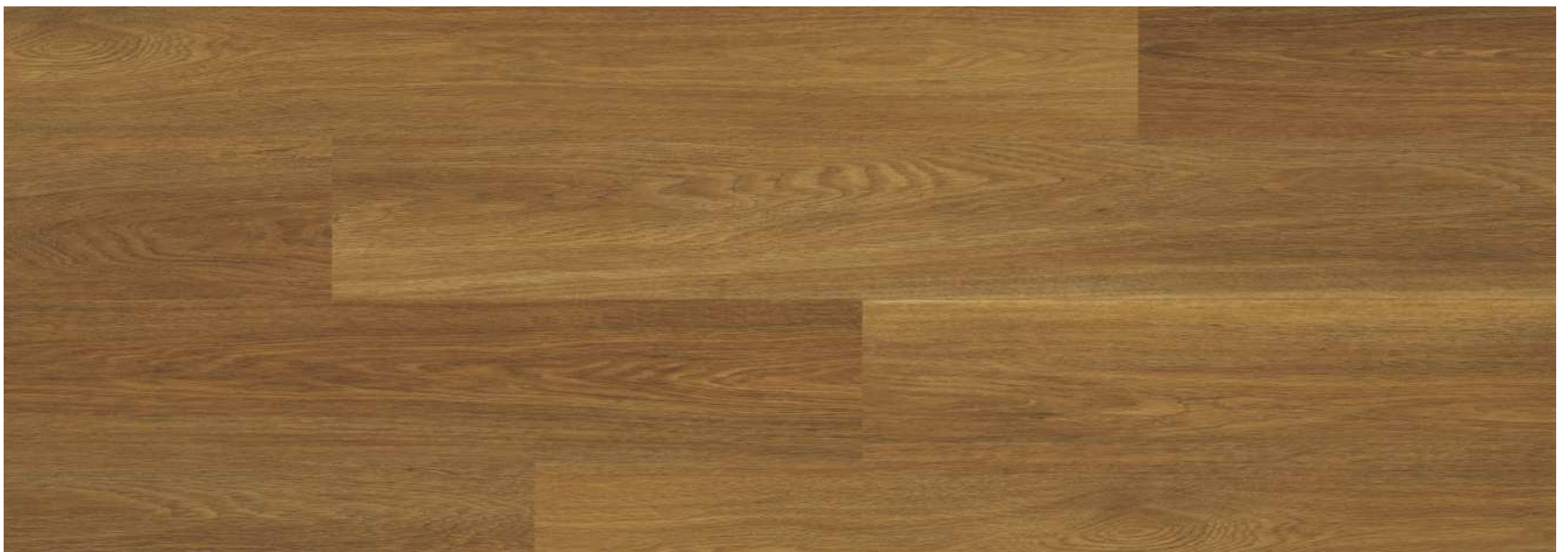
CMD 5152 W Arashiyama