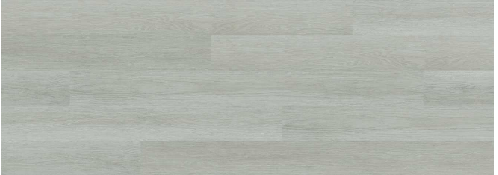
CMD 5135 W Socotra