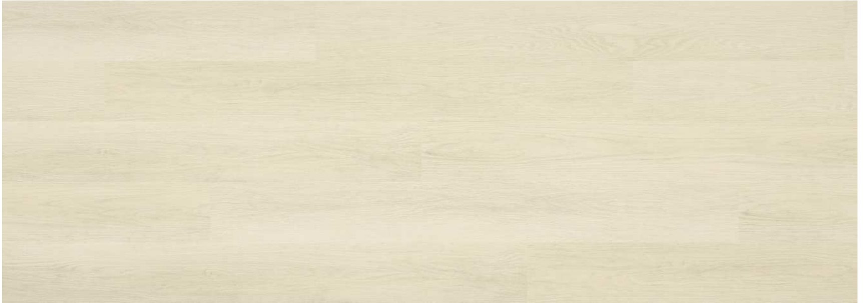
CMD 5101 W Banff