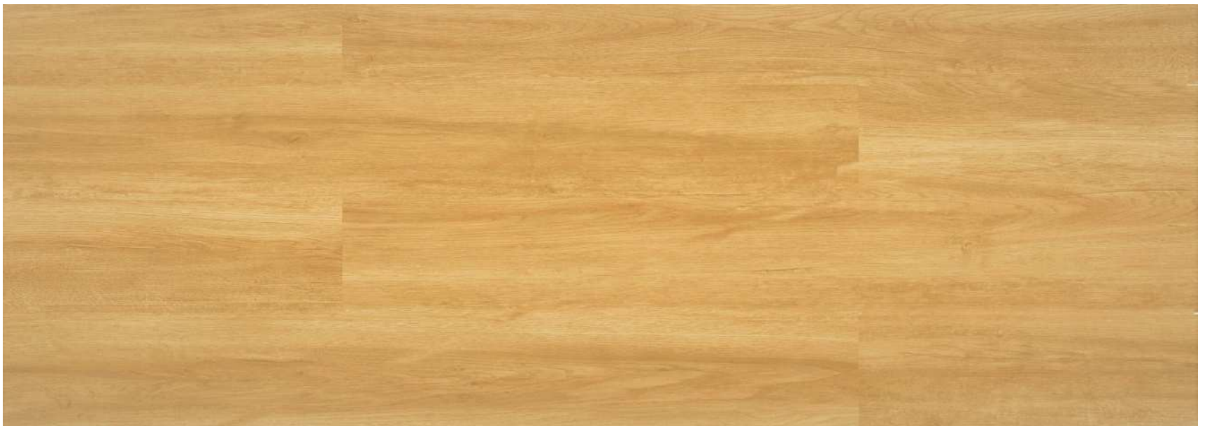
CMD 5169 W Monteverde