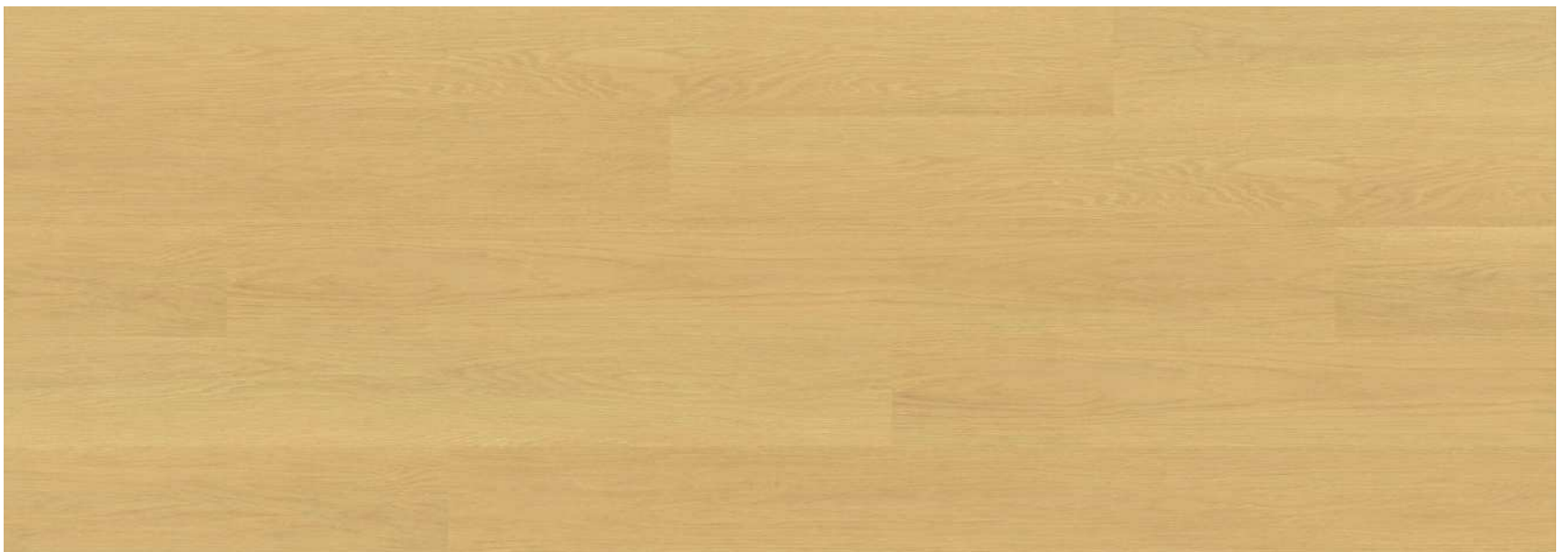
CMD 5128 W Lofoten