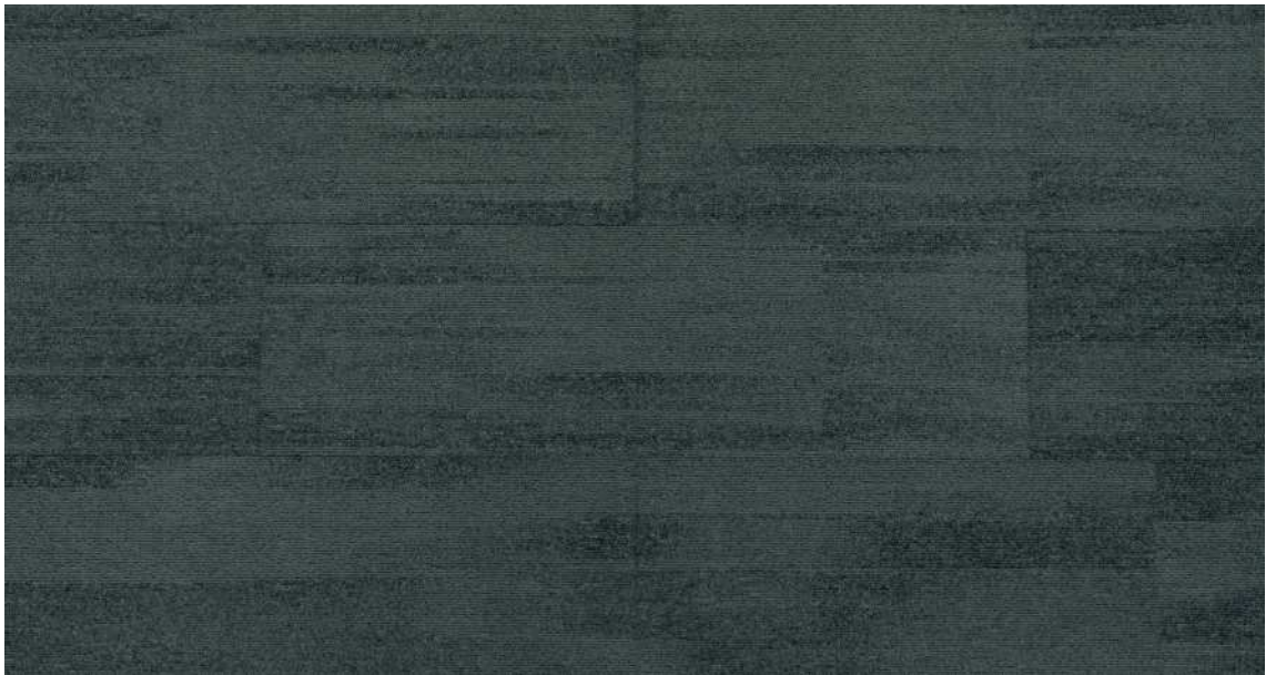
AG 1265 NIGHTHAWK