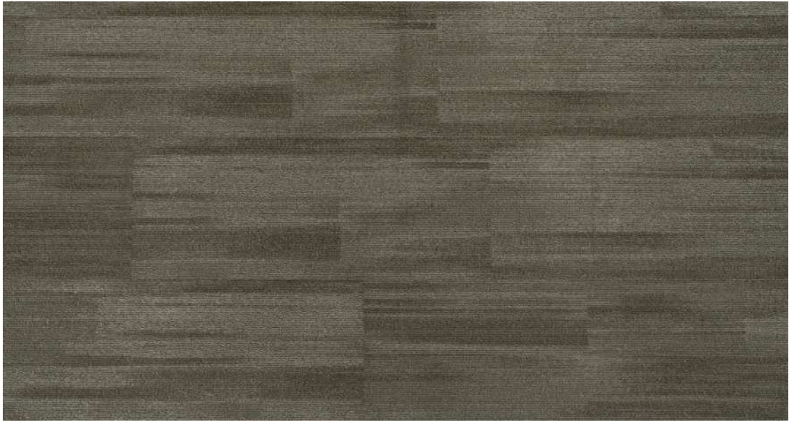
AG 1233 GEURNICA